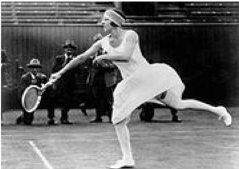
Suzanne Rachel Flore Lenglen (May 24, 1899 – July 4, 1938) was a French tennis player who won 31 Grand Slam titles from 1914 through 1926. A flamboyant, trendsetting athlete, she was the first female tennis celebrity and one of the first international female sport stars, named La Divine (the divine one) by the French press. Prior to Lenglen, female tennis matches drew little fan interest, which quickly changed as she became her sport's greatest drawing card. [from Wikipedia.]