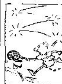
Make Your Opponent Run After the Ball