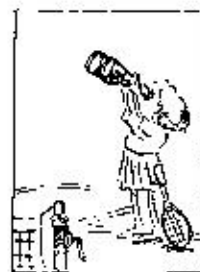
Put the Ball Over the Net