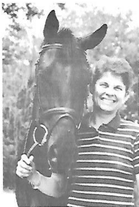
Editor and friend. (Editor is on right)