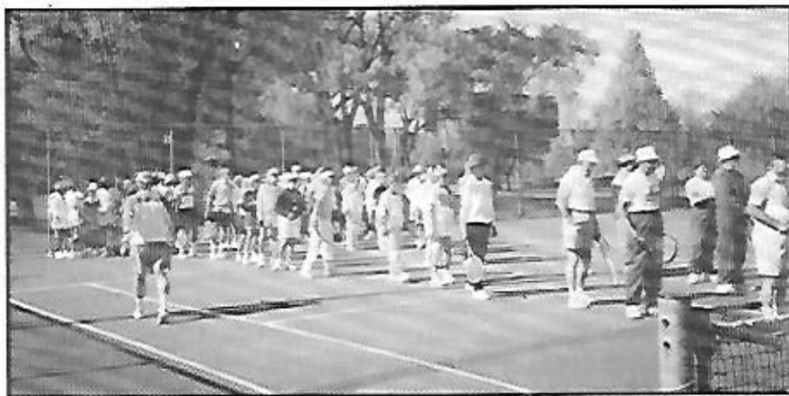
Below: 76 STPC members participated in the drills.