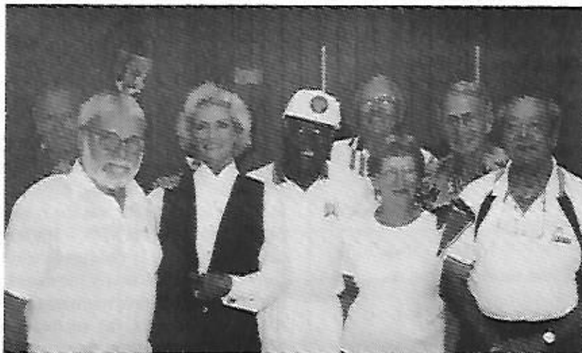
The Dow Tournament Committee