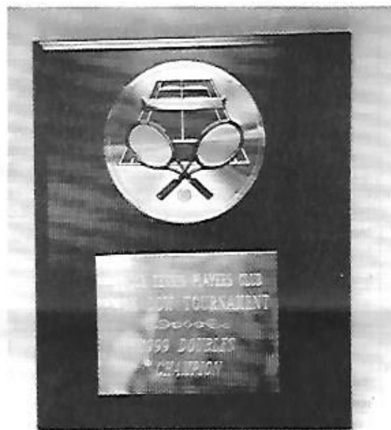
The Jack Dow Tournament Trophy

The committee offers their congratulations to all 52 winners and runners up, who were delighted with the attractive trophy plaques that will add beauty to any trophy case.