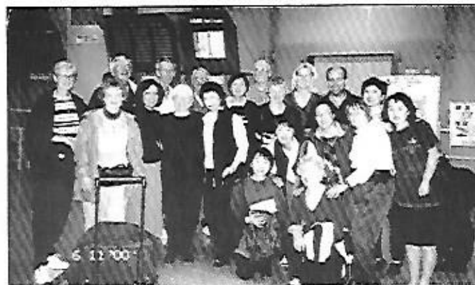
Twelve Minnesotan tennis players were greeted at Ibaraki Airport by the Japanese players who visited Minneapolis last year as part of the Minneapolis/Ibaraki sister city exchange.