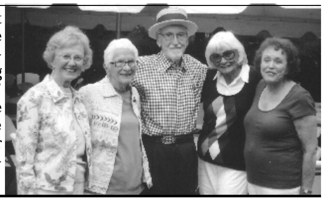
Page 11—Senior Tennis Times/Jan-Feb 2010

we're getting so many that we've introduced a new age category in our database. Instead of the last category being "80+" we now have "80-89" and "90+". If you or someone you know is in that exclusive 90+ club, let your newsletter editor know. And congratulations!